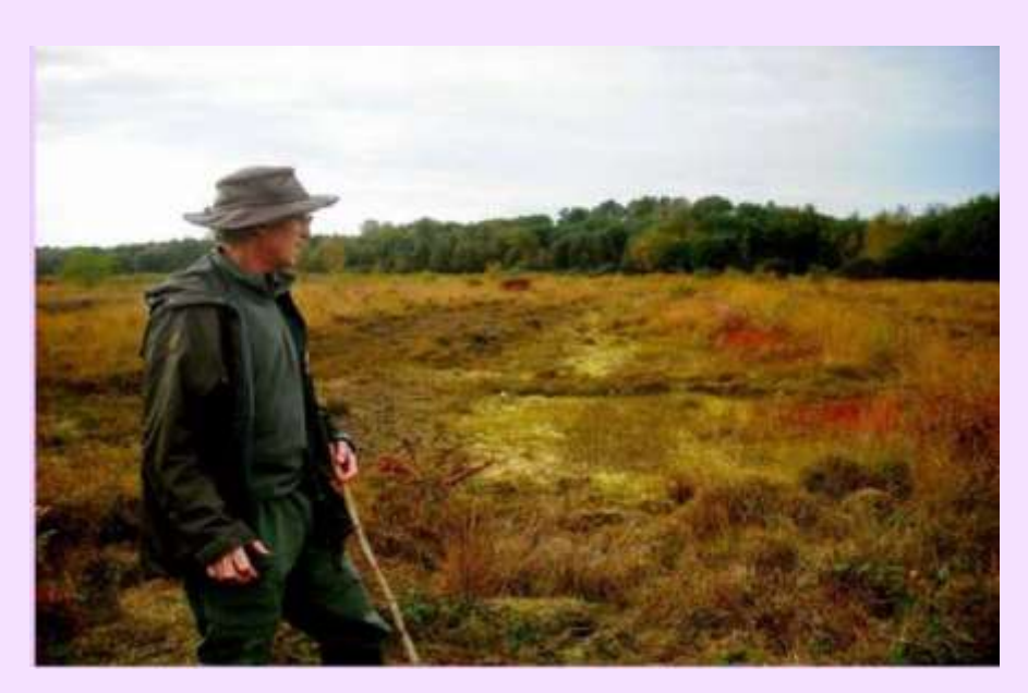
Photo 5: Creation of raised bog community on Westhay Moor (Somerset Wildlife Trust)