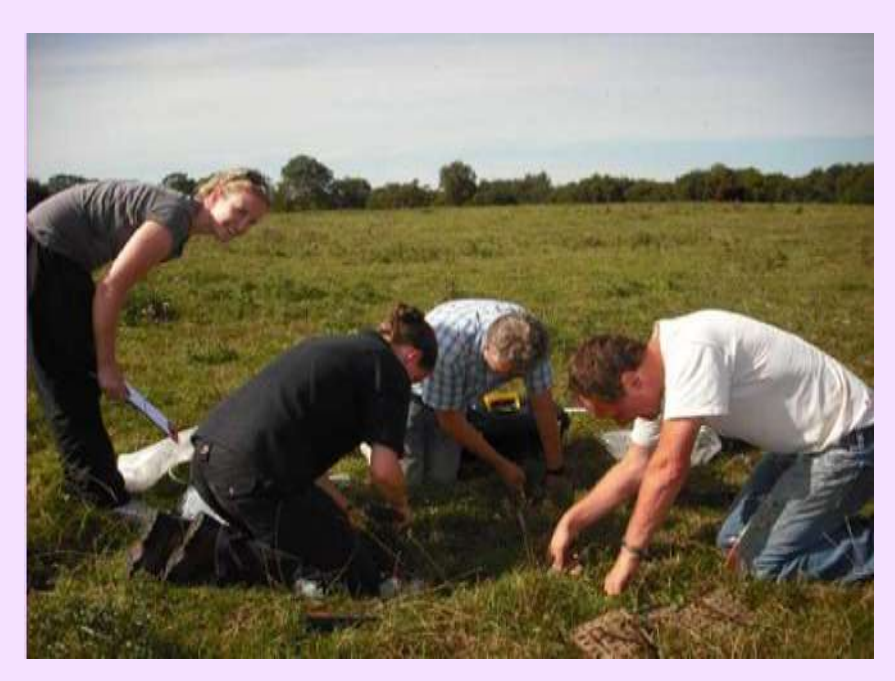
Photo 6: A research team from Reading University investigates conditions of the burial environment for organic archaeological remains