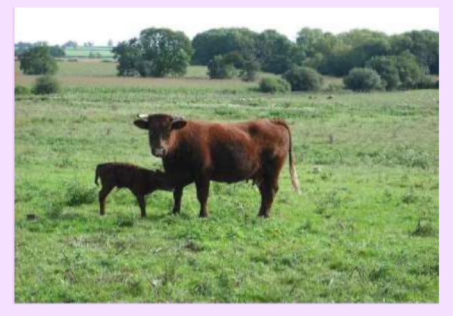
Photo 2: Small-scale mixed farming on land restored following the removal of raised bog peat

Where fields are surrounded by wide ditches (termed rhines in Somerset) (photo 5), water levels are penned higher in summer to act as wet fences, and lower in winter to provide flood water storage capacity (photo 6). Where the intention is to create or retain wet grassland habitats, it should be borne in mind that soil water levels in fields relate to those in adjacent rhines for only a matter of tens of metres distance, with the seasonal change in rainfall-transpiration balance causing the water table profile within fields to fluctuate from saucer- to dome-shaped.