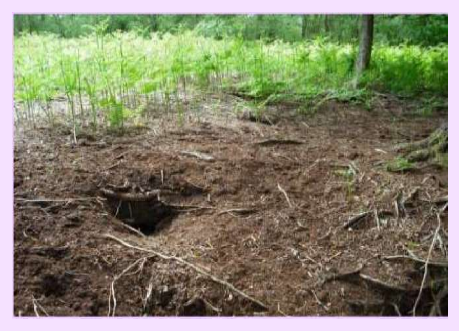
Photo 3: Cut-over area of dried-out former raised bog now under woodland with bracken and further disrupted by animal burrows